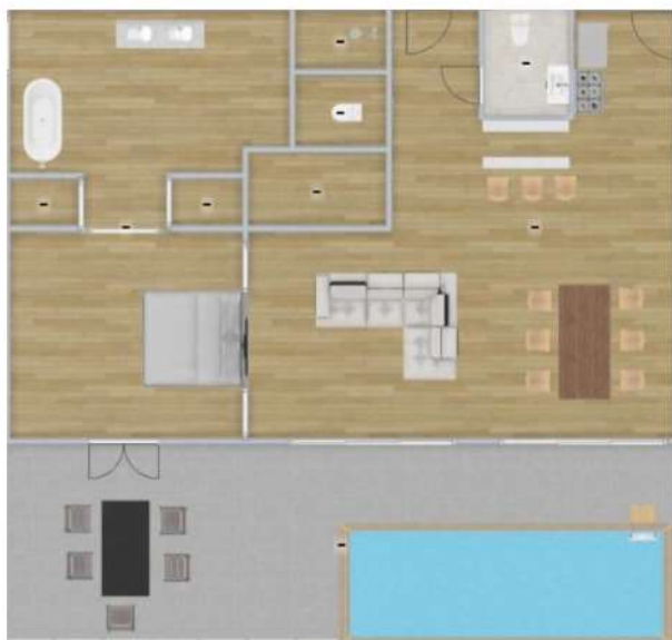
Preferred Club Presidential Suite – 8 th floor

King bed: 3 adults or 2 adults and 2 children