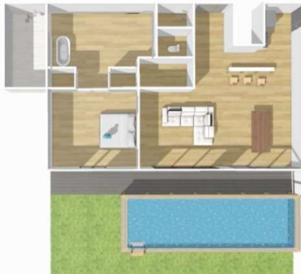
Preferred Club Presidential Suite – Ground floor